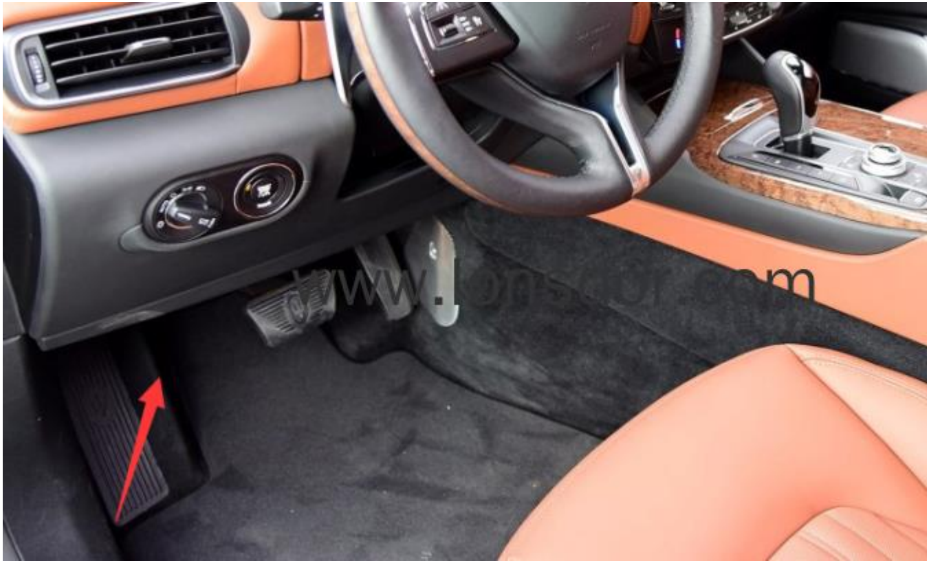
SUV : Levante