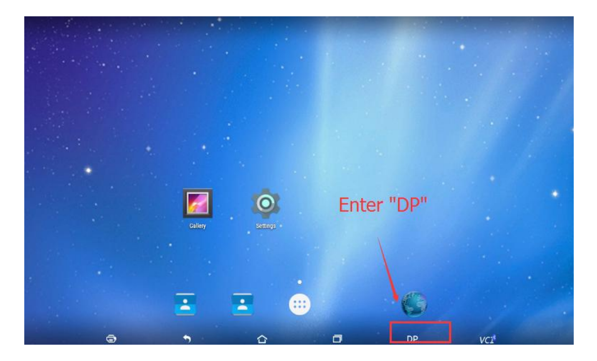
Step 2. Begin to update your device.